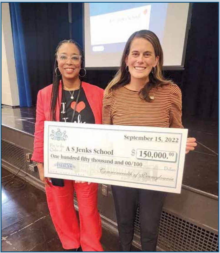
It was my pleasure to join the Principals, staff, students and parents of Key School and A.S. Jenks School to announce grants I helped bring back to improve the playground and outdoor space at both schools!